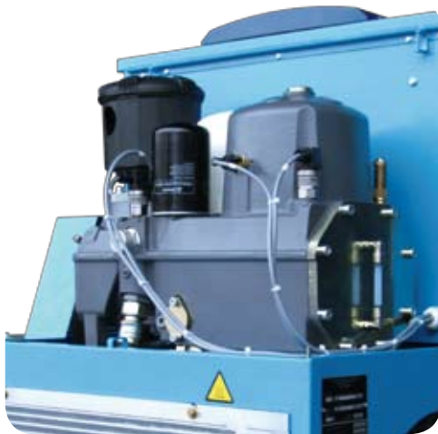
Grouped Service Components

All component parts are designed for long service life. Generously-sized suction filters, oil filters and final separators ensure long service life and excellent compressed air quality.