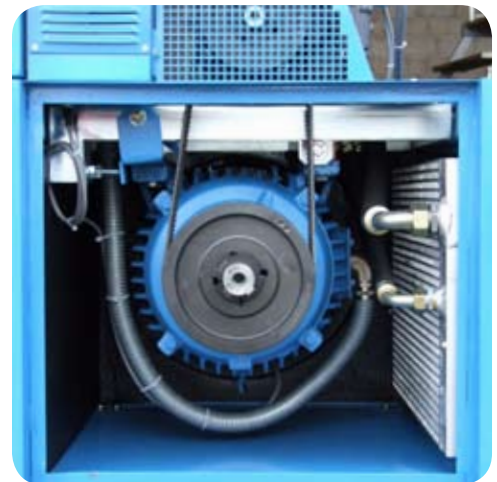
A Reliable and Highly Efficient Drive System