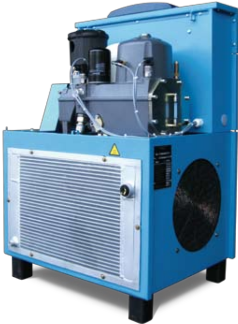
Easy Access for Service

An air/oil separation system incorporating centrifugal, gravity and filtered separation ensures the highest quality air.