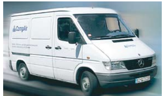
PROTECTION FOR YOUR PEACE OF MIND

The CompAir Platinum Warranty program delivers the most comprehensive plan in the industry with a standard 1-year warranty on all new machines and 5- and 10-year programs available simply by registering the machine at startup and use of CompAir warranty kits, lubricant, and participation in the oil analysis program.