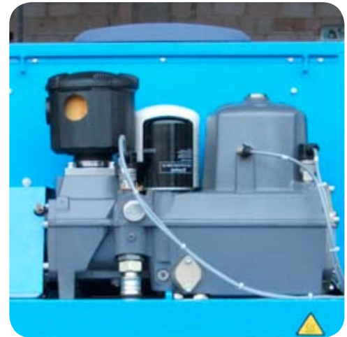
Fully Integrated Design