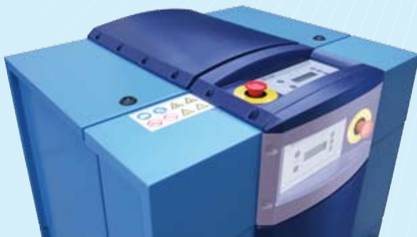
Dual Position Controller