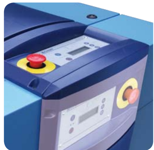
Dual Position Controller